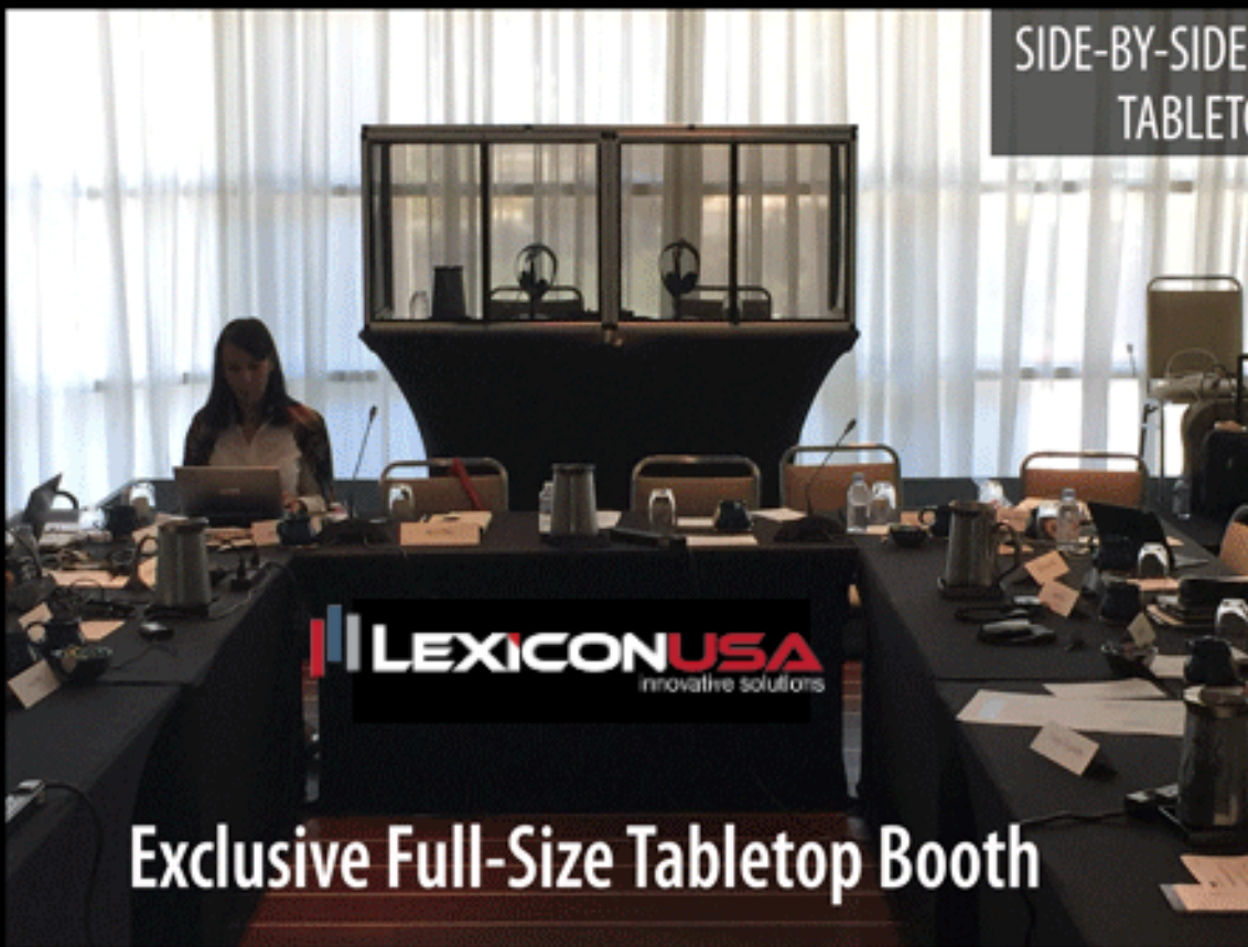
Exclusive Full-Size Tabletop Booth