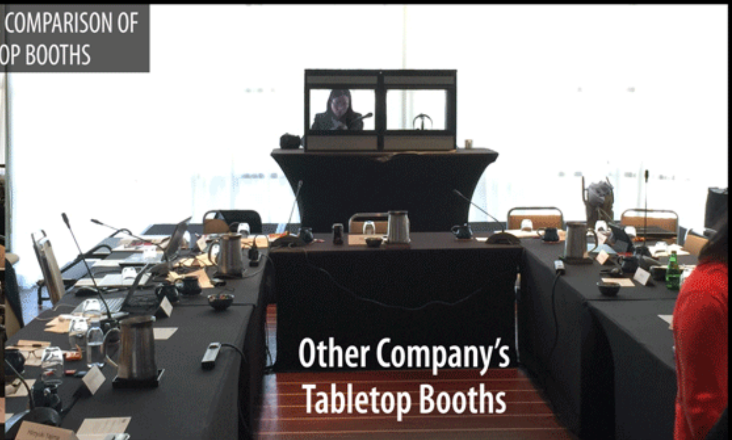
Other Company's Tabletop Booths